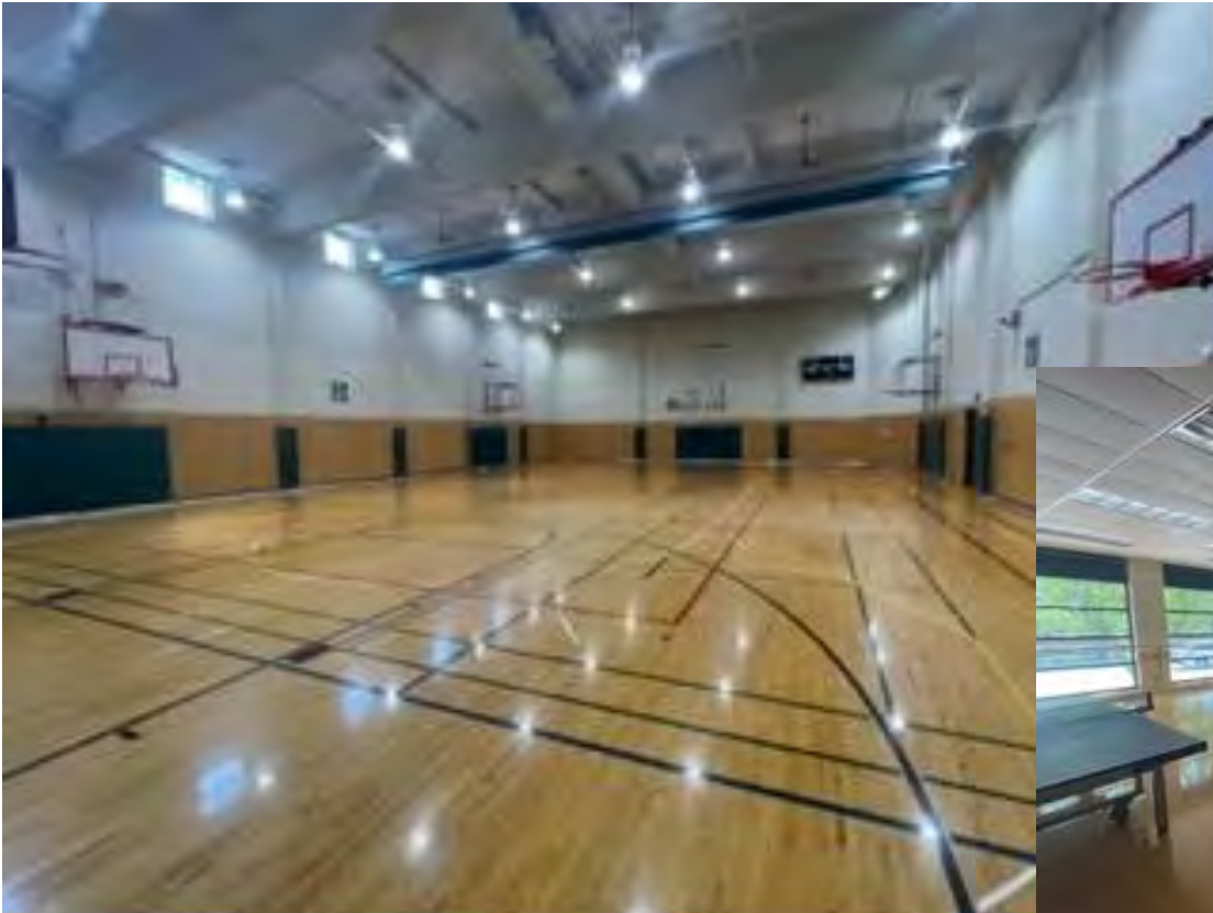
Gymnasium capacity is 395