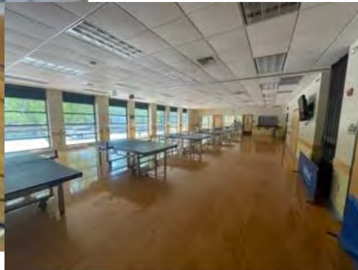
Multipurpose room off lobby for retail